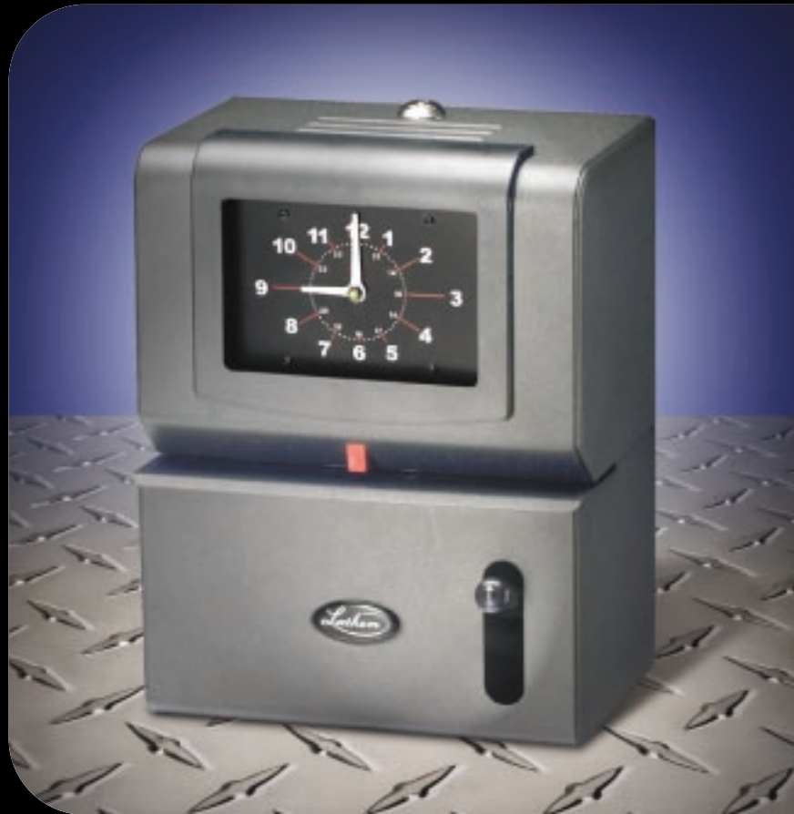
2100 Series (Charcoal Gray)