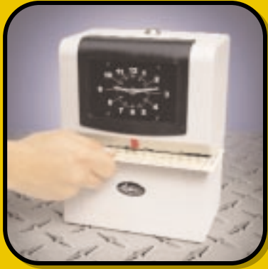
4200 Series (Cool Gray)

Need a steel tough time clock without a tough price? Lathem's mechanical time recorders can't be beat. Ideal for payroll time or job costing, these heavy duty time clocks can withstand high volume use and harsh environments. Whether you choose automatic (4000 Series) or manual (2000 Series) activation, the indestructible coined steel type wheels offer smooth reliable operation and a crisp clear registration every time. Mounted securely to a wall or on a tabletop, the steel case and key lock provide a durable and tamper-proof installation. The two-color ribbon self-reverses at the end of the spool for longer life, and can easily be changed. Works with almost any standard time card.